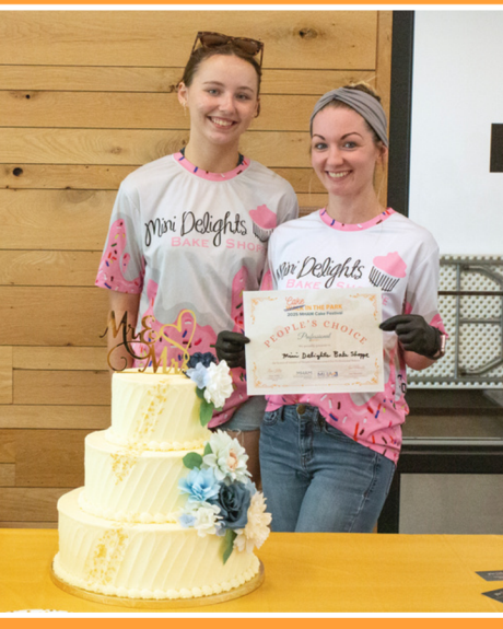
Mini Delights Bake Shoppe receiving the Professional People's Choice award at our inaugural Cake Festival