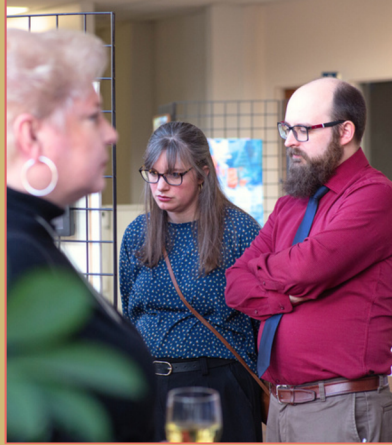
(Right) Attendees during our first annual art exhibit 'Journey of the Mind Through Artistic Visual Expression'