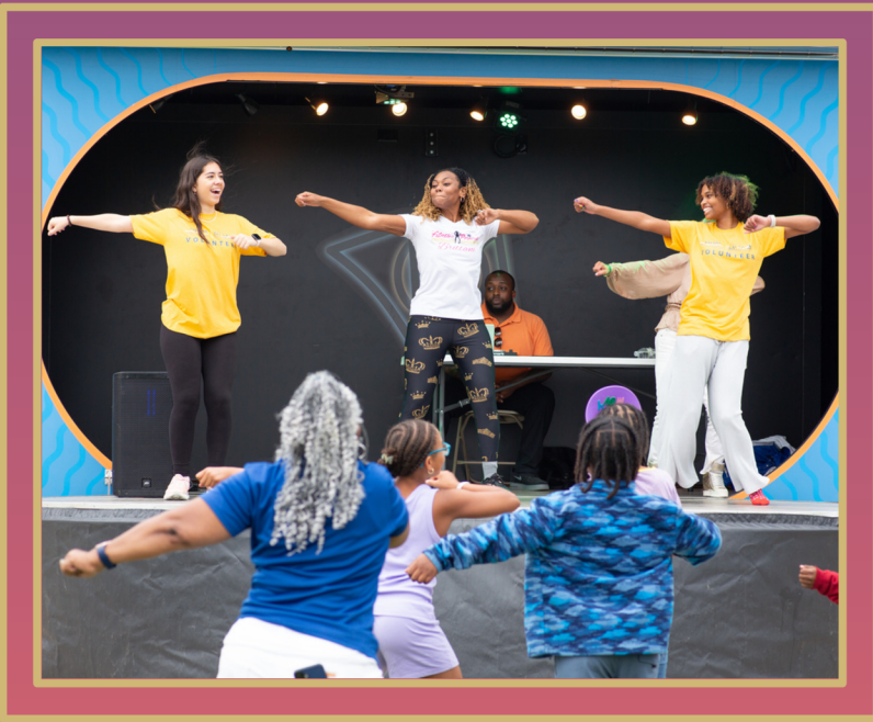
(Above) Crowd at our annual Family Fun Fair in Howard Park, South Bend